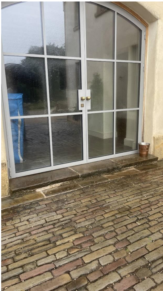
Entrance to The Carriage House

A ramp will be in place to facilitate access into the Carriage House building. Our Front of House stewards will be available to support any customers who require assistance.