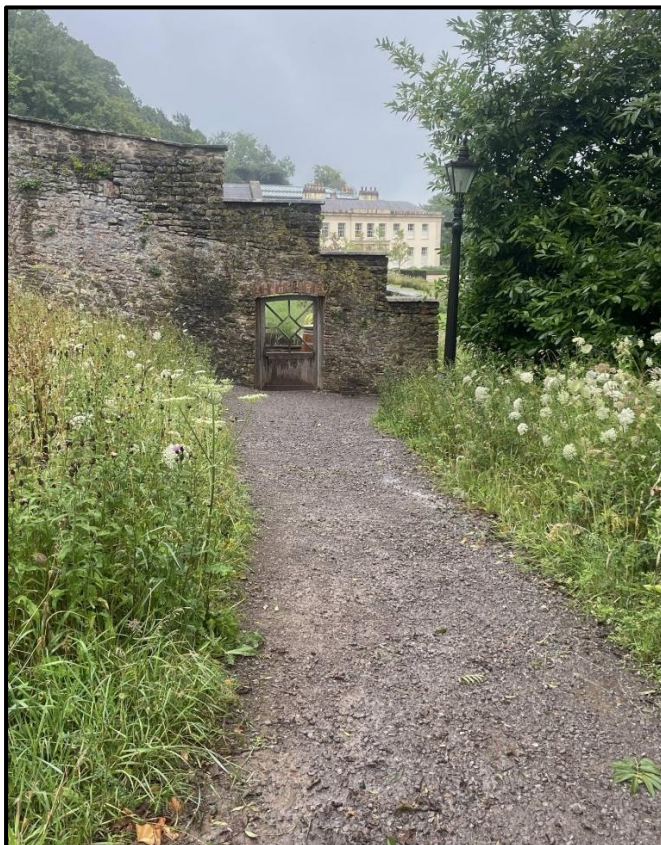
Entrance to the Walled Garden

The Walled Garden Entrance and performance area is 25m from the car parks via a tarmac path.